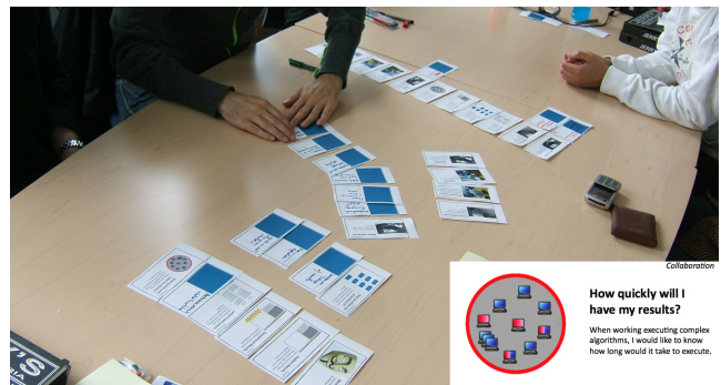
Figure 3. Topical organization of focus cards

As for the topical organization of focus cards (figure 3), it led to a new category we had missed; namely communication. This led to the generation of a whole set of focus cards