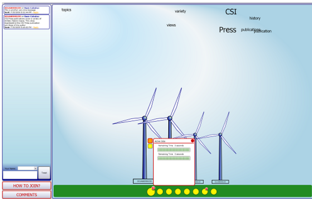
Figure 2. GridOrbit’s public display with 3 machines connected.

Our second project is GridOrbit , a public awareness display which visualizes the activity of a community grid used in a biology laboratory (Figure 2). This community grid executes bio-informatics algorithms and relies on users to donate CPU cycles to the peer-to-peer grid. The goal of GridOrbit is to create a shared awareness about the research taking place in the biology laboratory. This should promote contributions to the grid, and thereby mediate the appropriation of the grid technology. Our contextual analysis for GridOrbit sought to understand sharing and collaboration habits for molecular biologists while working in the lab. Our methods included place-centered observations, task-centered observations, and interviews.